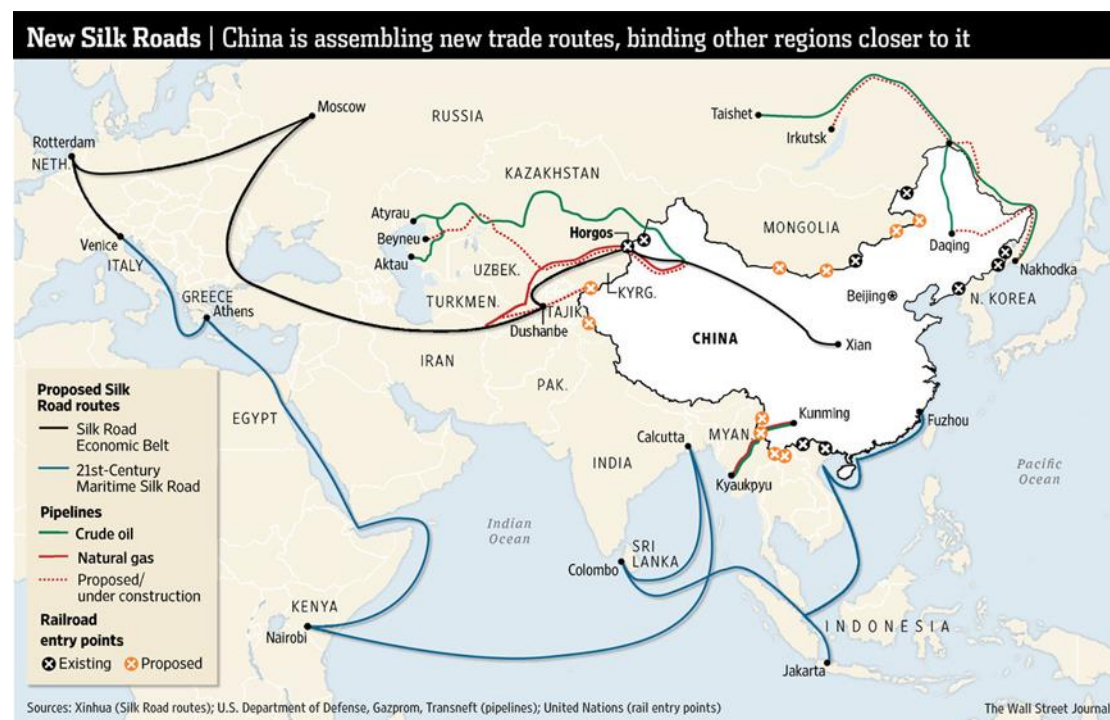
The land and maritime road of the "One Belt, One Road" initiative

The first signs of OBOR were brought to the surface during the Olympics of 2008. However, China's ambitious plan was first stated on 2013, by the Chinese President Xi Jinping, the 5th president of China. The OBOR project consist of two different "routes", one land route and a maritime one, that both begin and end in China's territory. The first route (Silk Road Economic Belt) begins from Xi'an in Central China and leads to Northern Europe up to Rotterdam (busiest port in Europe), coming all the way from Central Asia, the Middle East, Eastern Europe and Russia and the center of Europe. On the other hand, the maritime route (the 21 st Century Maritime Silk Road) connects the Mediterranean Sea with the South China Sea, in a long route that comes through the Suez Canal, the Indian Ocean, the Malacca strait, etc. It is estimated that approximately 65-70 countries and a total of 4,4 billion people (as much as the 60% of global population) will benefit from the participation in the OBOR project that will require at least 30-35 years to be completed. 4