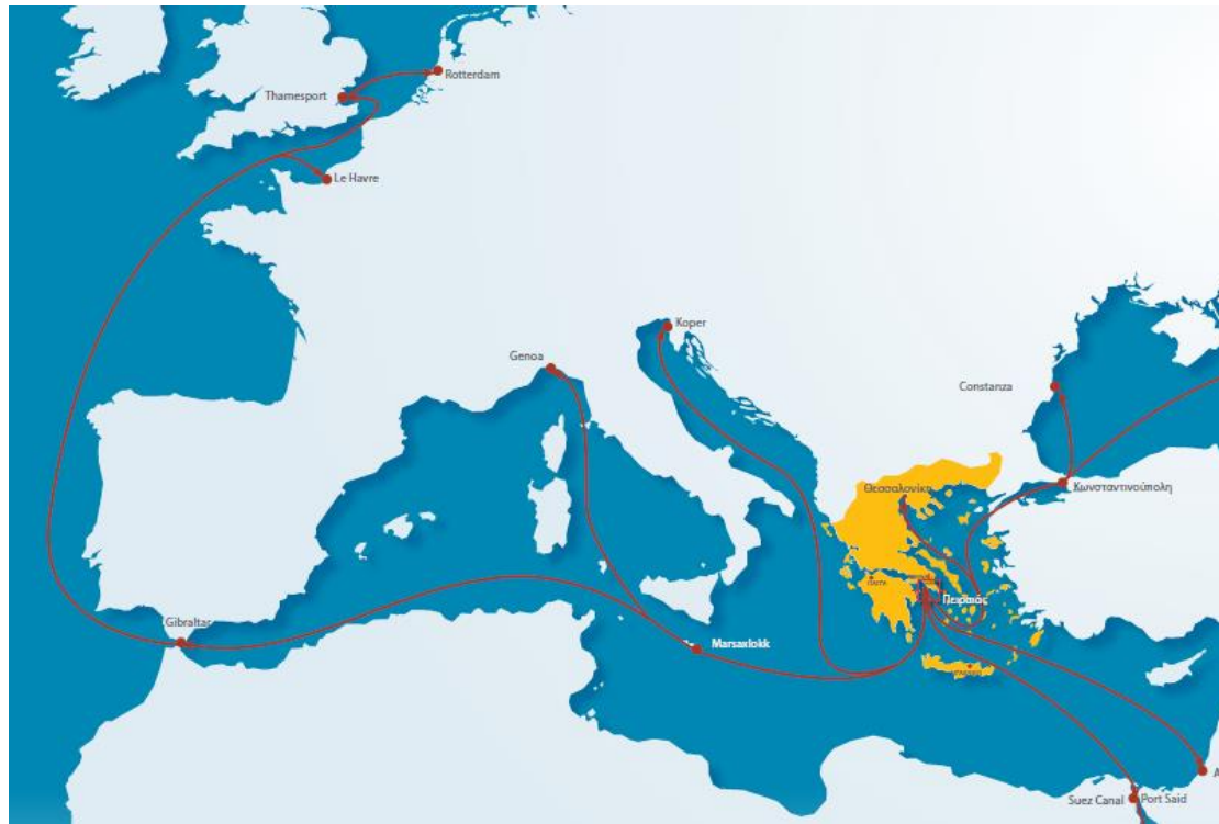
The strategic location of the port of Piraeus, and its distance from major European and neighboring ports.